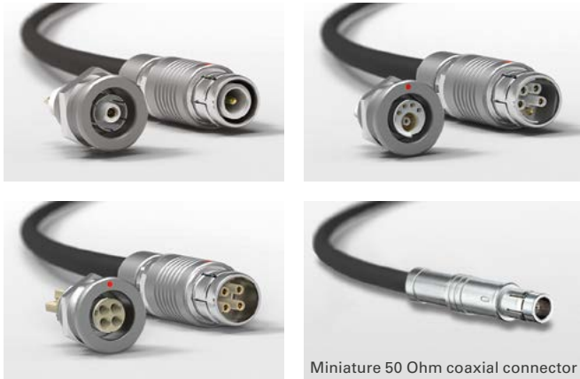
Miniature 50 Ohm coaxial connector