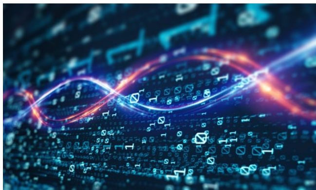
Increased data transmission and new standards are emerging, such as Single Pair Ethernet (SPE).

standards within one (i.e., HDMI, Display Port, USB) form factor and supporting power transmission, USB-C enables larger transmission speed, up to 40 Gbps (USB 4). The combination of these two factors makes USB-C the new champion, with other connections slowly losing the battle, the striking example being Apple's Lightning.