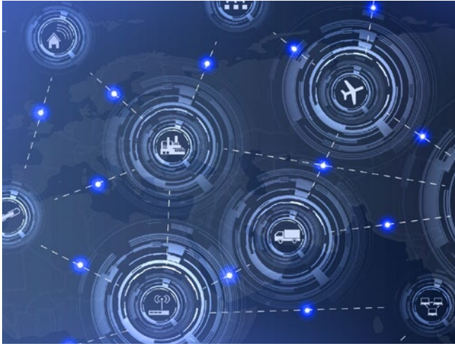
5G has introduced higher global bandwidths and increased access to cloud-based processing, e.g. AI, facial recognition, etc.

As a consequence, alternatives to public 5G networks were necessary for the emergence of small revolutions such as Industry 4.0 (largely enabled by the Industrial Internet of Things, IIoT), AR/VR or widespread robotics. Private 5G networks were born as an answer to that conundrum. Organizations build their own networks and can do this according to two models that involve very different financial outlays. The first is large-scale deployment, with the purchase of significant hardware and allocation of large teams to manage it. The second is purely cloud native, and is paid for per usage, in an “as-a-service” setting. This second model gives access to private 5G networks and their benefits to smaller companies – the user has the final say.