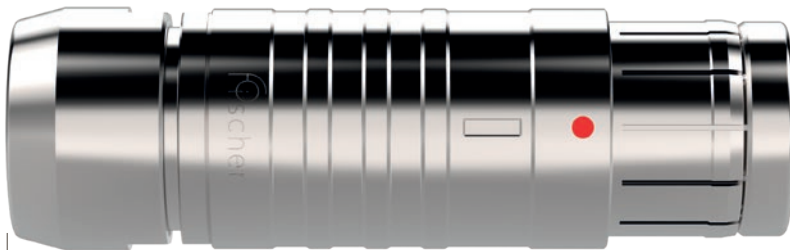
107 (4 to 55 contacts)