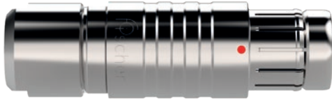
105 (2 to 27 contacts)