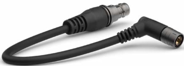
Straight and 60° thermoplastic overmolds for Fischer UltiMate™ Series and Fischer MiniMax™ Series