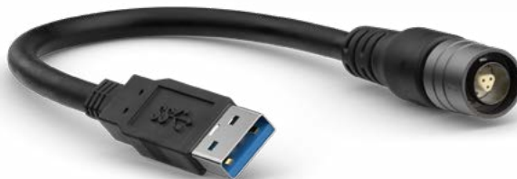
USB 3.0 using Fischer MiniMax™ Series