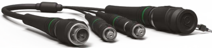
Fischer FiberOptic Series with multiple terminations

Fischer Connectors has helped hundreds of customers find the right cable assembly solution that fulfills their unique technical, quality and cost requirements. We support your project from design to manufacturing, making your life easy.