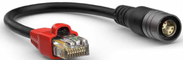
Ethernet using Fischer MiniMax™ Series